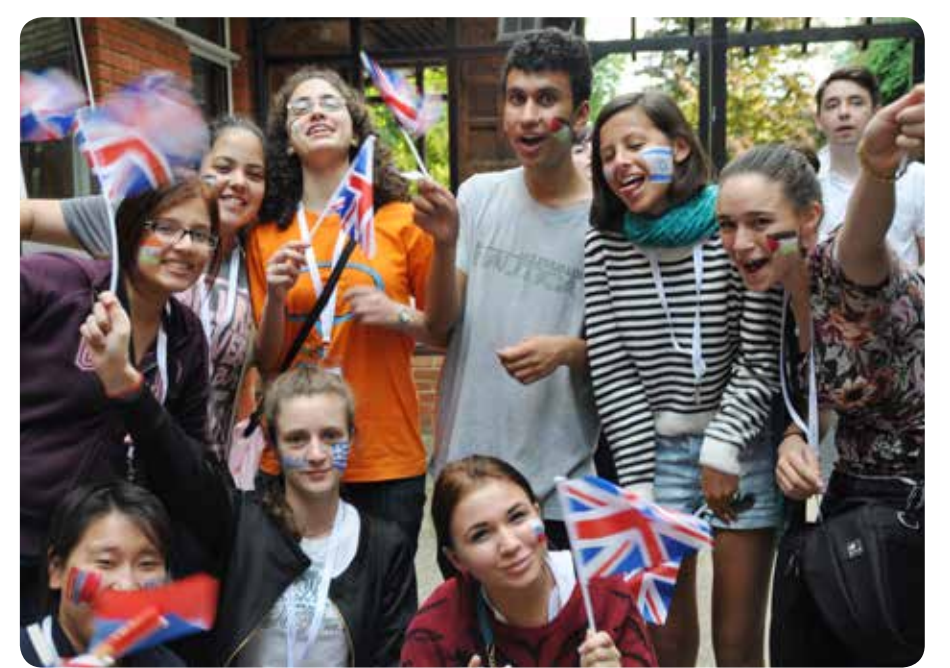
"Amazing, unforgettable and incredible – the happiest three weeks of my life!"