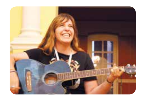
"I loved every day at the Ingenium Academy"